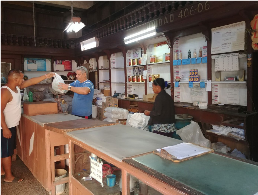
Figure 5 Local resident having his quota weighed by the bodeguero [Colour figure can be viewed at wileyonlinelibrary.com ]

informal role in such situations, the bodeguero gave his own vivid example, showing how far his flexibility can stretch on occasions: ‘When someone dies the family will go to OFICODA to get them removed from the libreta , but some people don’t do that and just continue getting the goods, and sometimes I’ll give them a break and play dumb. I tend to find out about everything that happens in the neighbourhood.’