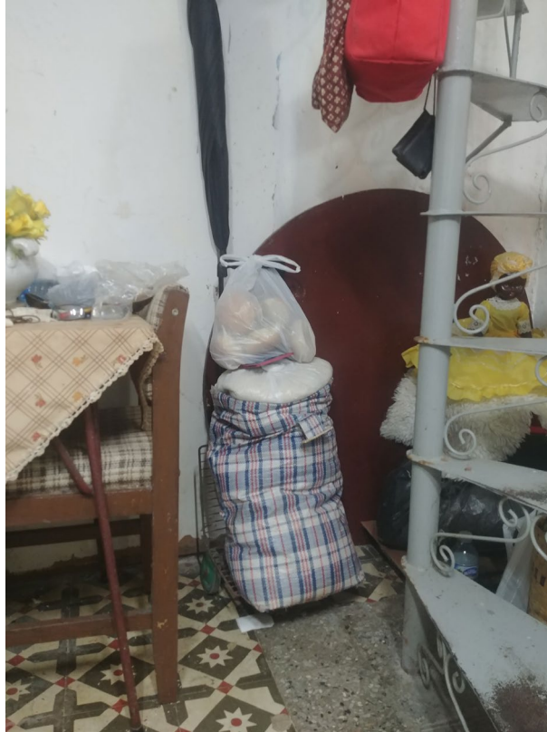
Figure 1 Bags of ' mandados ' kept in the home – rice and bread from the bodega [Colour figure can be viewed at wileyonlinelibrary.com ]

dietary provisions. 4 In interactions with the SSP, then, the notebook comes to serve as a prime means of identification, representing the family's entitlements within the system, as well as recording their use on a monthly basis, acting in this way as a kind of bureaucratic metonymy for the family itself. In fact, one may think of the notebook's metonymic status as operating in two directions at once. In one direction, it allows the family to which it belongs (and which it represents in Alfred's Gell's indexical sense of 'acting as a representative of'; 1998: 98) to project itself into the administrative processes of the SSP. In the other direction, understood as an official document in its own right – a document 'of the state' – its presence inside the home renders the notebook a prime vehicle for the state's metonymic projection into the intimate sphere of family life.