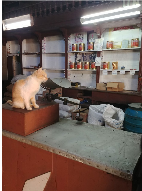
Figure 6 The bodeguero's cat on the counter [Colour figure can be viewed at wileyonlinelibrary.com ]

embody the state system which he metonymically represents, enforcing its norms and regulations when the circumstances require it. Instead of a metonymic flow that renders continuous the official sphere of the state and the intimate sphere of the family, in the figure of the bodeguero we have a discontinuous alternation between the two. If the state remains largely in the background of everyday interactions between the bodeguero and his clients, moments such as the one described above, in which the bodeguero enacts his role as enforcer of the system's regulations, render the normative force of the state as a figure of social life and a direct and explicit object of social interaction. This combination of features – a discontinuous alternation between state norms and ordinary life, and rendering the state an explicit object of consideration – come to the fore in the next two sections, in which we sharpen the ethnographic focus onto the way actors themselves conceive of their dealings in and with the SSP.