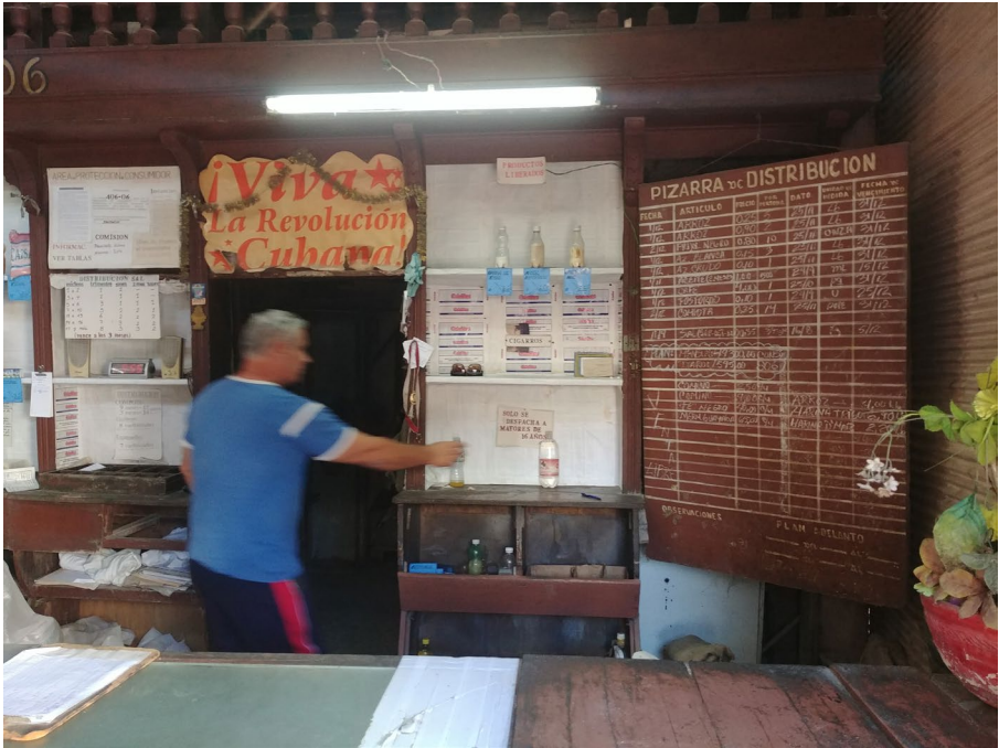
Figure 4 ‘¡Viva la revolución cubana!’ Behind the counter of la bodega , with ‘board of distribution’ showing quantities of goods to which local residents are entitled [Colour figure can be viewed at wileyonlinelibrary.com ]

so my cats stay here. It’s better to have cats than to have mice.’ Furthermore, the sense of the bodega as part of the neighbourhood’s social landscape relates also to this particular bodeguero ’s personal popularity. He’s a ‘good guy’ ( buena gente ), people in the neighbourhood say, fun to be around, charismatic and easy to deal with. With secondary-school education, and now in his 40s, the bodeguero has been in charge of this particular bodega for 22 years, and is by all accounts well embedded in the neighbourhood. As one neighbour put it, ‘the bodeguero has been in this bodega for so many years that it’s almost like he owns it. He’s had relationships with various girls from the neighbourhood and he’s quite a guy, but since he has money lots of them want to be with him.’