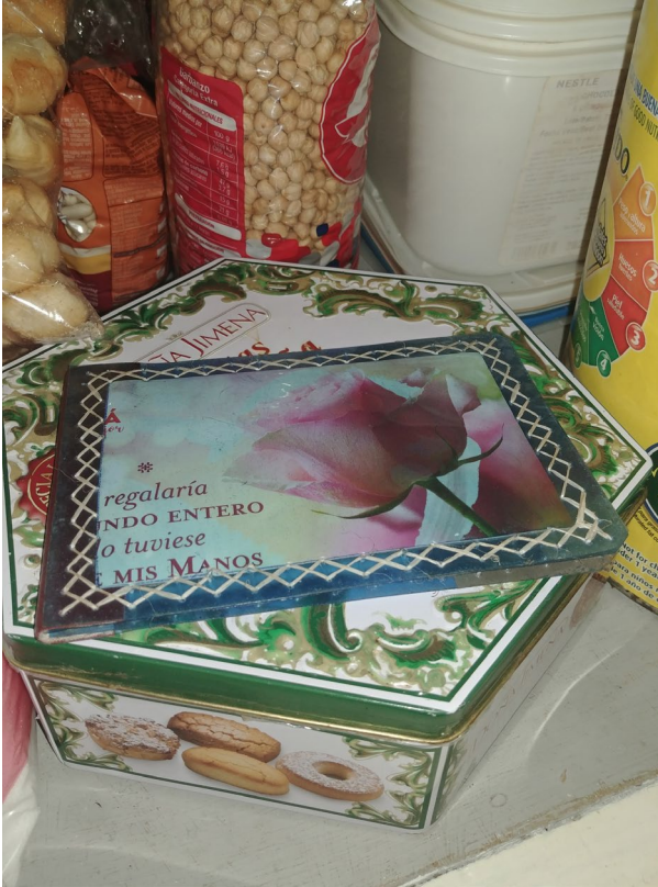
Figure 2 Libreta kept at a ‘handy’ spot in the kitchen cupboard, and decorated in a personalised way with protective bind [Colour figure can be viewed at wileyonlinelibrary.com ]

relationship between the SSP and the families it is charged with serving. As we saw, the movement of goods distributed by the state outlets of the SSP effectively carry the state into the home, inasmuch as the goods are understood as being ‘of the state’. A similar metonymic projection, however, occurs in the opposite direction, from families towards the state process of the SSP. This has to do with the marked sense of entitlement on which the system is premised and which its operation habituates. Enshrining the monthly quota of goods corresponding to each family as a matter of personal entitlement (rather than merely something that is offered for purchase or provided as a service), the SSP effectively establishes an internal (Ollman 1975), mutually constitutive (Sahlins 2013) relationship between people and the goods the SSP distributes not just to, but also for , them. Established and held up as an attempt by the state to provide for the ‘basic needs’ ( necesidades básicas ) of its citizens, there is an important sense in which the goods that the SSP provides are as much ‘of the people’ as they are ‘of the state’. This is also reflected in the language people use to refer to the goods in question, which is suffused with assumptions of ownership. The grandmother’s observation about not being in a hurry to get the family’s quota from the bodega is in line with such common expressions as ‘they have to arrive’,