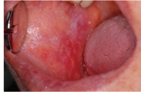
FIGURE 1: Clinical features of oral lichen planus manifested as keratotic, atrophic, and erosive components in buccal mucosa.

The study process and its objectives were explained to all patients, and informed consents were obtained. Then, the demographic, historical, and clinical data related to OLP were recorded. During the oral examination sessions, the patients were questioned regarding the possible existence of pruritic cutaneous lesions of LP, as well as any of the genital symptoms of pain, burning or pruritus, discharge, and dyspareunia. Then, incisional biopsy samples were taken from the patients from a representative part of the oral lesions' margin by one of the authors. All patients with histopathological diagnosis of OLP, regardless of having genital symptoms or not, were referred for examination of the vulvovaginal and cutaneous areas to Shahid Faghihi Polyclinic, Shiraz University of Medical Sciences, within one week after oral examination. At the clinic, careful vulvovaginal examination of each referred patient was performed by the collaboration of two authors specialized in fields of gynecology and dermatology. At the same appointment, clinical assessment of