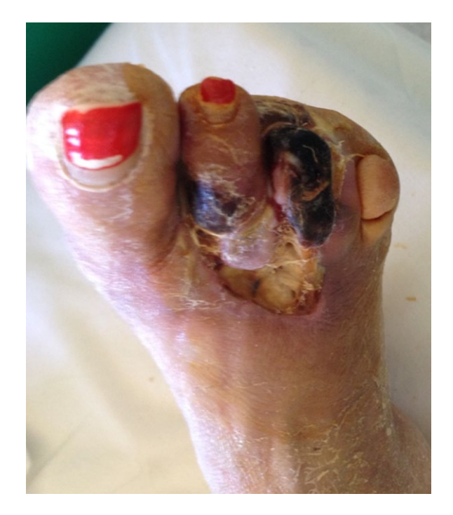
Fig. 3 Photograph of the right foot of a 53-year-old diabetic woman shows a DFU at the dorsum of the foot and dry gangrene of the second and third toes. She was treated with third ray amputation, wound debridement, intravenous antibiotics and blood glucose control.

Autolytic debridement is a method to liquefy a necrotic tissue with moist wound dressing. A wound covered with an occlusive dressing allows accumulation of tissue fluids containing macrophages, neutrophils and enzymes, which remove bacteria and digest necrotic tissues.