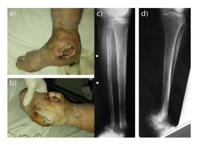
Fig. 1 a, b) Photographs of the right foot of a 69-year-old diabetic woman with a heel and a medial malleolus purulent DFU. c) Anteroposterior and d) lateral radiographs of the right leg show complete distortion of the ankle and talar joints and osteolysis at the distal tibia and fibula. She was treated with a below-knee amputation, intravenous antibiotics and blood glucose control.

erythematous and indurated (sausage toe). Probeto-bone test is a useful clinical diagnostic tool for osteomyelitis; if a blunt sterile metal probe gently inserted through a wound strikes bone, this substantially increases the likelihood that the patient has osteomyelitis.<sup>43</sup> Plain radiographs of the foot have relatively low sensitivity and specificity for documentation or exclusion of osteomyelitis (Fig. 1). MRI is the imaging modality of choice for the diagnosis of osteomyelitis. When MRI is unavailable or contraindicated, leukocyte or antigranulocyte bone scans may be performed.<sup>41</sup> The definitive method for diagnosing osteomyelitis is a bone-tissue biopsy with histological sections showing inflammation and infection or a positive result on bone culture.<sup>40</sup>