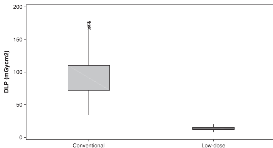
Figure 1 Comparison of the conventional and low-dose lumbar periradicular injection doses.

A total amount of 50 perineural injections were performed in the low-dose protocol at the lumbar spine. Compared to 50 perineural injections performed in the conventional interventional CT-protocol, an average dose reduction of 85.31% could be achieved using the low-dose protocol (see Figure 1 and Table 1). We calculated a mean DLP of 13.87 mGycm 2 (SD = 2.48) for the low-dose CT-protocol cohort (mean age = 57.46 years, range 21-87; 27 females, 23 males; mean BMI = 25.52)