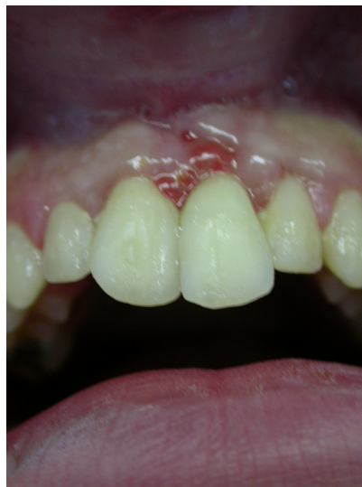
Fig. (1). Localized hematoma crossing the attached gingiva from the free gingival margin to the vestibular mucosa.

A 12-year old boy presented at the Endodontics and Dental Trauma Unit located in our hospital, due to dental trauma. The medical and dental history was taken, followed by a thorough physical examination, neurological test, extra- and intra-oral examinations, and radiographic examination. The clinical examination showed laceration of the lips, and laterally luxation of the face and of the first right and left maxillary incisors. A localized hematoma crossing the attached gingiva from the free gingival margin to the vestibular mucosa was observed, adjacent to the left maxillary incisor (Fig. 1).