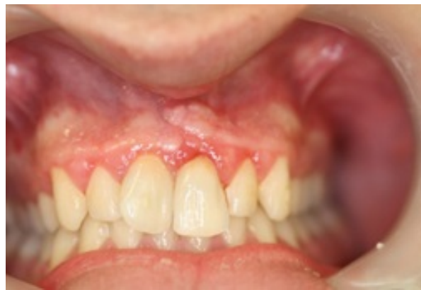
Fig. (3). Follow-up clinical examination shows the vertical bone resorption as the fracture area.