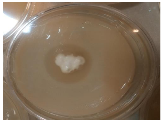
Figure 2. Proteolytic activity on agar plates containing gelatin as substrate (left), after ammonium sulfate decoloration (right)

There is a wide range of studies on epidemiology of dermatophytosis and its causative agents across Iran and other countries indicating different agents and clinical manifestations. T. mentagrophytes in Yazd [13], T. rubrum in Turkey [14], T. sudanensis in Nigeria [15], E. floccosum in Karaj [16], T. verrucosum in Isfahan [17], and T. interdigital in Tehran [18] were the most common etiological agents of dermatophytosis in those studies. Human skin is a large, heterogeneous organ that protects the body against pathogens while sustaining microorganisms that influence human health and disease [19]. Dermatophytic fungi were shown to have keratinolytic and other proteolytic and lipolytic activities [2]. It is evident that secreted proteolytic