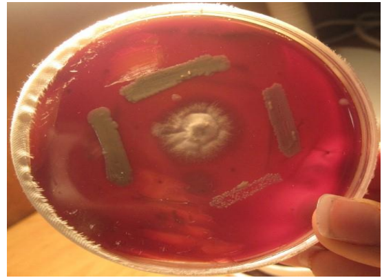
Figure 1. Haemolytic activity and CAMP-like effect: complete zone of hemolysin and CAMP-positive reaction with standard Trichophyton species (left) and CAMP-negative (right)