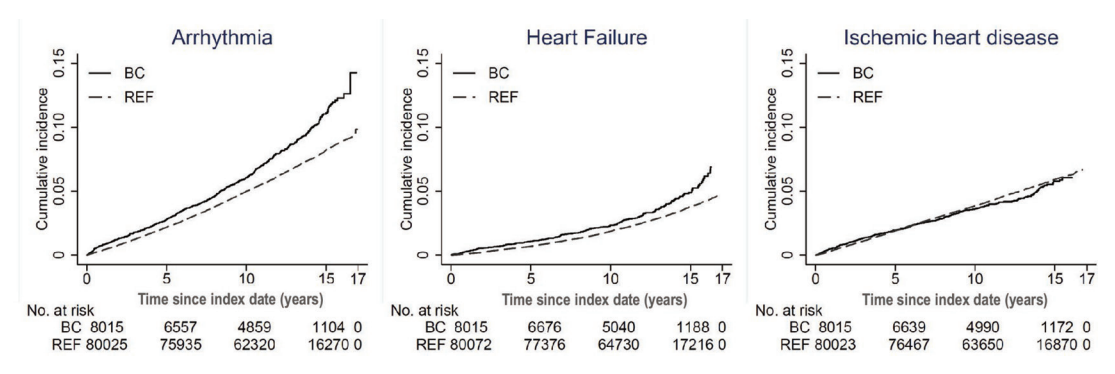
Appendix 3—figure 1. Cumulative incidence of heart disease in breast cancer patients and matched women. Aalen-Johansen estimates of the cumulative risk of heart disease by time since index date, in breast cancer patients and matched women from the general population. BC: breast cancer; REF: reference women in the matched controls from the general population; No.: number.