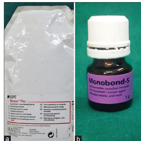
Figure 5: (a) Rocatec plus-silica-coated aluminum oxide, (b) silane coupling agent

and seated firmly over the prepared teeth using finger pressure for 5-min excess cement was removed. For the copings of Groups A2, B2, and C2 to be cemented with Panavia F 2.0 [Figure 6b], equal amounts of ED Primer