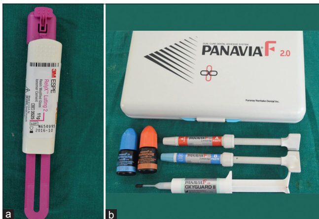
Figure 6: (a) Resin-modified glass ionomer cement, (b) methacryloyloxydecyl dihydrogen phosphate monomer-containing self-adhesive

P < 0.05 , ***Highly significant. SD: Standard deviation