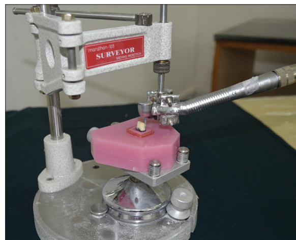
Figure 2: Custom clamp attached to surveyor for tooth preparation

The tray adhesive (3M ESPE VPS, Seefeld Germany) was applied to the intaglio surface of the custom trays fabricated using autopolymerizing acrylic resin. Impressions of the prepared tooth were made with polyvinyl siloxane putty and light body material (3M ESPE, Seefeld Germany) and poured with scan-able die material. The master dies were trimmed and scanned in dental wing scanner which sent the command to the computer-aided manufacturing (CAM) machine (CNC Milling Machine vhf CAM 4-02, Germany) for the milling of the zirconia copings from the presintered zirconia blanks (ZIECON, Jyoti ceramics Pvt. Ltd., Nashik, India). In each of the copings, a 2-mm diameter hole was drilled in the predesigned 6-mm projection of the abutments using a round rotary cutting instrument (018; 801 Predator Zirconia, Prima Dental, India) with copious water irrigation [Figure 3]. The prescribed area for the hole was measured and marked for all the samples