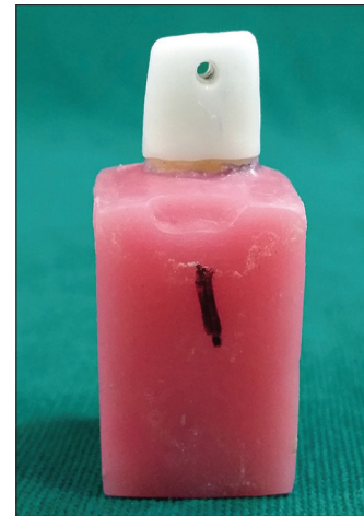
Figure 3: Milled zirconia coping with a hole

The copings of Groups A1, B1, and C1 were cemented with RelyX luting 2 using the clicker dispenser [Figure 6a]; base and catalyst were mixed in pad with a plastic spatula until uniform color was obtained. A thin layer of the cement was applied on the intaglio surface of the copings