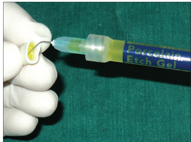
Figure 4: Surface treatment with hydrofluoric acid