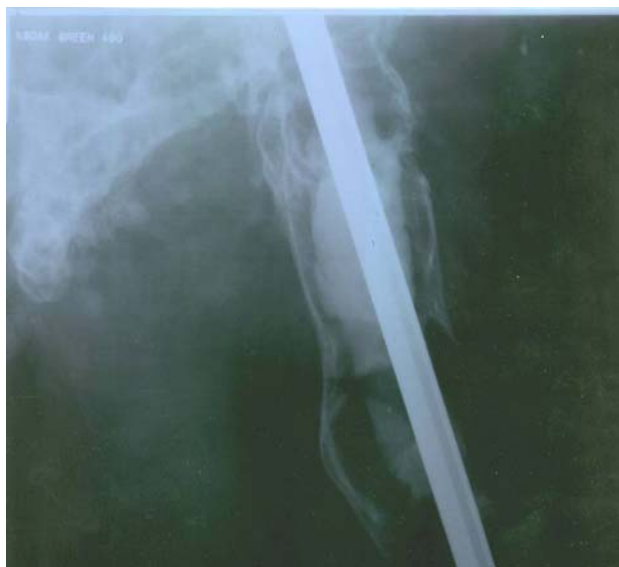
Figure 2 Plain x-ray of right femur showed advanced lytic destruction of bone, centered at the proximal two thirds of the right femur. There is also a nailing due to previous surgery.