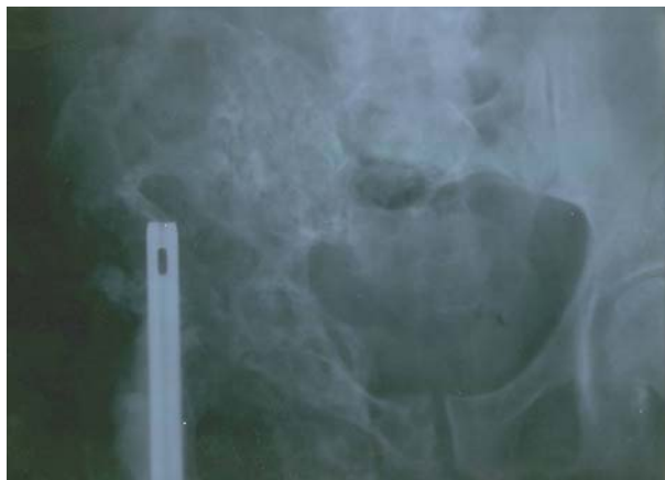
Figure 3 Plain x ray of the pelvis revealed marked lytic and sclerotic lesions involving the right hemipelvis.

Liver and lungs are the most commonly involved organs and involvement of bone and muscles is uncommon [9]. The prevalence of bone infection is 1.1% in nonendemic