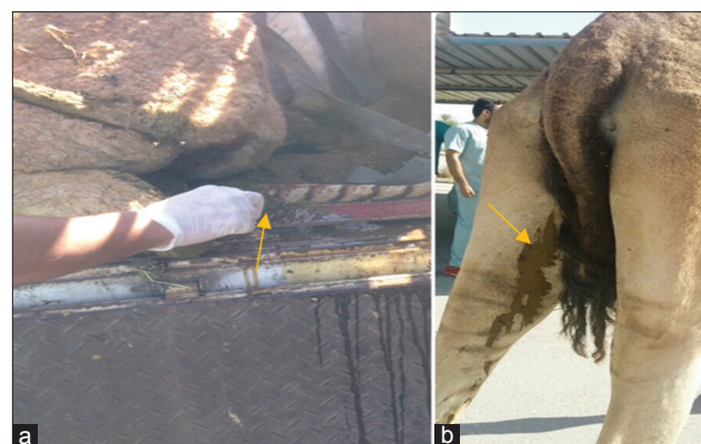
Figure-1: Clinical picture of Johne's disease. (a) Rectal scrapings in a camel suffered from chronic diarrhea. (b) Diarrhea on a camel hind quarter.

Several reports [1,20,28,29] urged that, within the Arabian Peninsula, the emerging MAP