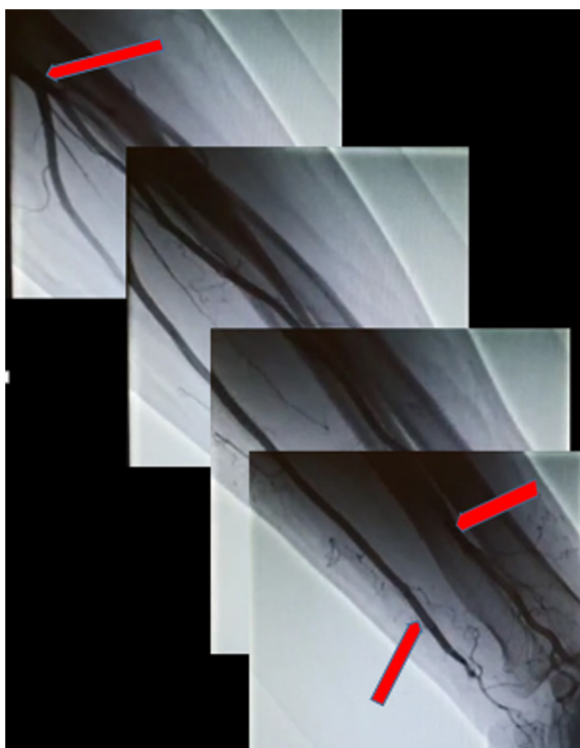
Fig. 2. During percutaneous intravascular angiographic intervention, the image taken after treatment showed a significant increase in flow in the distal of the brachial artery.