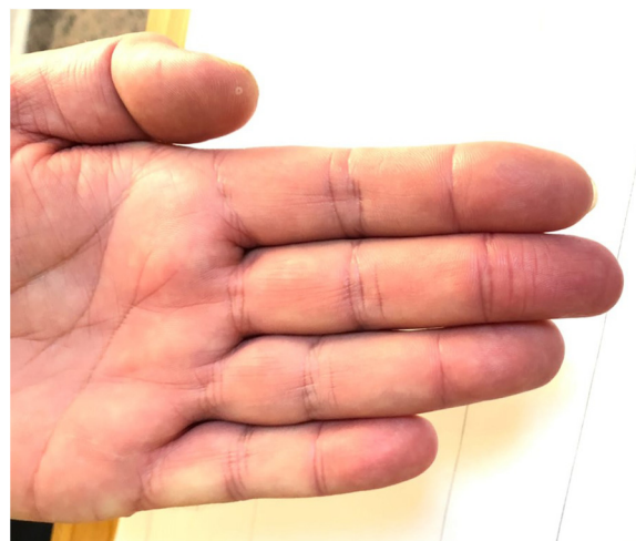
Fig. 4. In the image taken after the angiography of the patient, it is observed that the cyanosis in the toes disappeared.

testinal tract events (nausea, vomiting, fecal incontinence) may occur [4–7]. Consequently, severe anaphylactic shock may also lead to cerebral or myocardial ischemia accompanied by permanent sequelae [8]. The clinical picture of bee sting may rarely include diffuse alveolar bleeding, rhabdomyolysis, thrombocytopenic purpura, and vasculitis [5–8]. Although our case did not have any history, it was found appropriate to present because vasospasm and thrombosis developed in the brachial artery following bee sting. This is a very rare clinical presentation of bee stings according to the literature. It contains various chemical components that contribute to the clinical picture such as bee venom, enzymes (phospholipases, hyaluronidase) and biological amines (histamine, serotonin, dopamine, norepinephrine and acetylcholine) (9). Our patient was admitted to the emergency department with a bruise extending from his left hand to his arm after bee stings and was generally thought to be related to the dose of this poison.