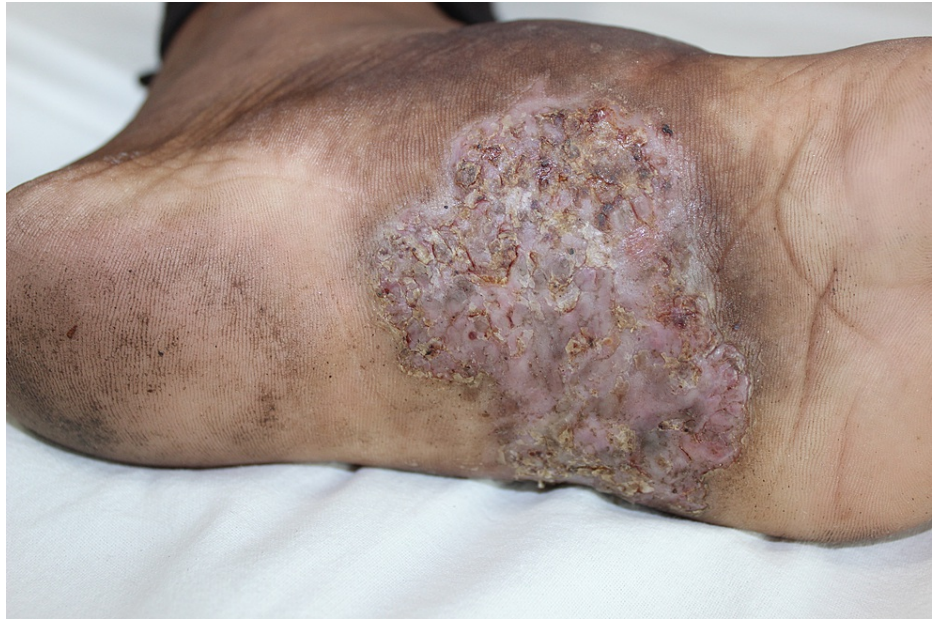
FIGURE 1: Well defined macerated erythematous plaque on the left sole with crusting and fissuring at places.

The pain was minimal, mostly associated with walking discomfort. The rest of the mucocutaneous and scalp examination was normal. He had tried over-the-counter medications with no significant improvement. There was no history of preceding trauma and discharge from the lesions. The differentials of endogenous dermatitis, lichen planus, subcutaneous fungal infection, and squamous cell carcinoma were kept and the lesion was subjected to punch biopsy of the skin. The histopathology report showed dense band-like infiltrate in the papillary dermis, focal vacuolar degeneration of the basal cell layer, and occasional necrotic keratinocytes (Figure 2).