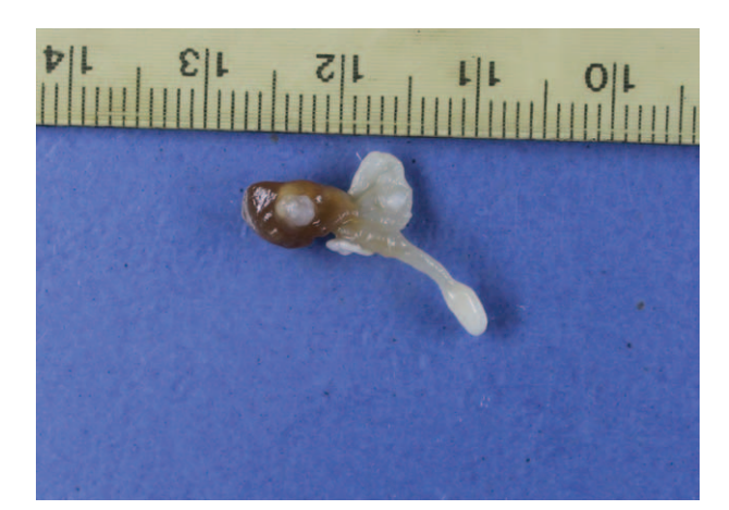
FIGURE 4. Gross appearance of the mass.

we found that both therapies have residual effects of mild restriction in the extreme fields of the upgaze. The patient was anxious about possible cyst growth in the muscle under long-term medical therapy treatment. Therefore, we decided to perform surgery on the patient.