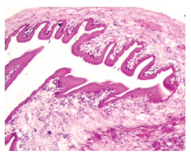
FIGURE 5. Histopathology of the cyst.

we found that both therapies have residual effects of mild restriction in the extreme fields of the upgaze. The patient was anxious about possible cyst growth in the muscle under long-term medical therapy treatment. Therefore, we decided to perform surgery on the patient.