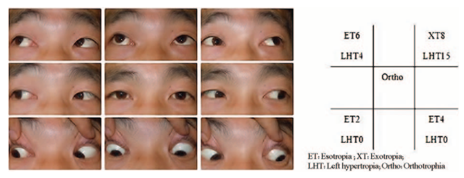
FIGURE 1. Clinical photograph of 9 diagnostic positions before operation and the measurements of deviation (showing limitation of elevation in adduction of the right eye). ET = esotropia, LHT = left hypertropia, Ortho = orthotropia, XT = exotropia.

side and to release soft tissue. Exploration was started through conjunctival (superior nasal fornix) incision. During surgical exploration of the superior oblique muscle, a swollen tendon came to view. The cyst flew from the tendon when the sheath was cut for almost 5 mm along the tendon (Figure 4). Pathological findings indicate a 25 mm of moderately firm pink-gray mass. The mass had cystic microscopic features, as confirmed through histopathological examination (Figure 5).