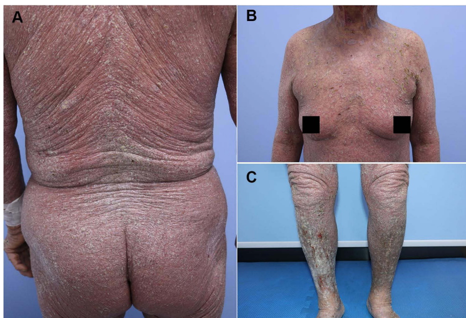
Figure 1 (A–C) The patient with diffuse infiltrative erythema and scaling lesion involving more than 90% of the total body surface area. (B) Co-localization of psoriatic plaques and tense vesicles and blisters distributed on her trunk, limb, and axillary, some of bullae rupture and leave an eroded base. (C) lower legs with hypertrophic lichen planus-like lesions with silvery-white scales and scratch.