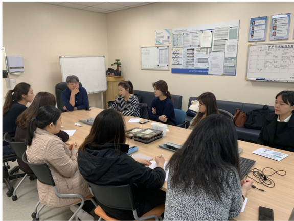
Fig. 2 A scene from a PBL meeting with triage nurses and emergency physicians

[29]. This tool is a numeric evaluation scale, with 0 points for the leftmost and 100 points for the rightmost for self-efficacy for triage, and the subject selects one point on a continuous line. And scored. The higher the score, the higher the level of self-efficacy.