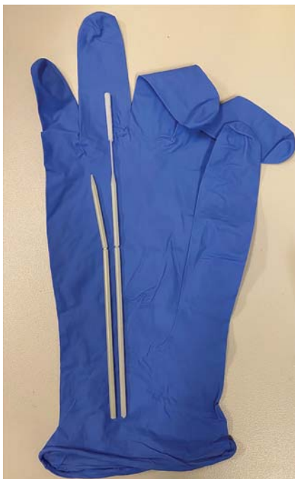
► Fig. 1 The COVID nasopharyngeal swab with broken tip from the patient compared to an intact COVID swab, with a medium-sized surgical glove in the background for comparison.

Deep nasal swab novel coronavirus (COVID-19) testing has become routine practice prior to hospitalization and almost all medical procedures since the start of the pandemic. We present the case of a 35-year-old woman at 40 weeks gestation who presented to the hospital for a scheduled elective induction and delivery for full-term pregnancy. On admission, she underwent routine testing for COVID-19 with deep nasal swab. The swab was inserted into her left naris, and while being rotated, broke off at the indicator line in the patient's posterior nasopharynx (► Fig. 1 ). Almost immediately, the patient felt pain in her throat that quickly subsided. Because the swab tip was lost, the patient underwent a second uneventful COVID-19 deep nasal swab, which was negative.