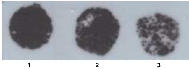
Figure 2 NIH-OVCAR 3, SKOV 3 and MDAH 2774 ovarian cancer cells coinfecting with rAAV-GFP (MOI < 1 I.P) and (wild-type) adenovirus. Viral particles were removed after 2 hours and cells were given fresh medium. The in situ replication centre assay was started 28 hours after infection. Membranes were hybridized with a P^{32} -labelled GFP probe. Autoradiography was developed after 4 hours. Without adenovirus present no signal could be detected, even after long expositions (48 hours, data not shown). The presence of replication centres coincided with detection of green fluorescent cells.

(1) NIH-OVCAR 3 (2) MDAH 2774 (3) SKOV 3