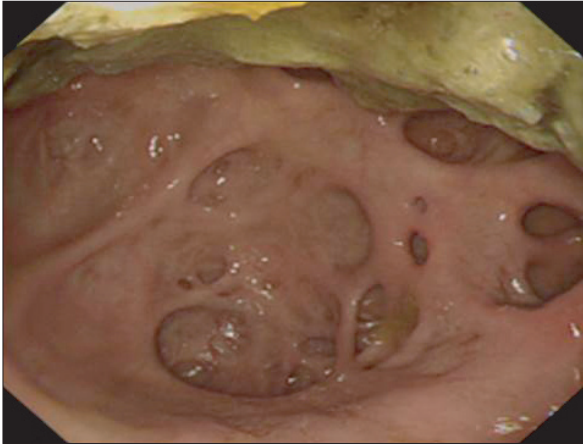
Fig. 1. Diverticula in the second and third portions of the duodenum on gastroduodenoscopy.

WBC count of 11,190/\text{mm}^3 (normal range, 4,000\text{--}10,000/\text{mm}^3 ) and low hemoglobin level of 9.6\text{ g/dL} (normal range, 12.0\text{--}16.0\text{ g/dL} ). We also found low albumin level of 1.6\text{ g/dL} (normal range, 3.3\text{--}5.3\text{ g/dL} ) and 2.9\text{ mmol/L} low potassium level (normal