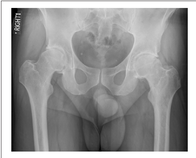
Figure 1. Pre-operative radiograph: pre-operative AP plain film radiograph depicting bilateral hip osteoarthritis with the presence of osteophytes, joint space narrowing, sclerosis, and cam-type femoroacetabular impingement.

home exercising, stretching, and resting had not provided significant relief.