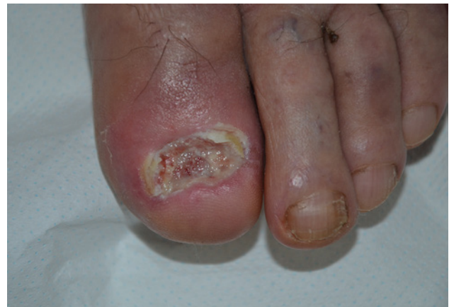
Figure 4. SCC long-standing subungual lesion, evolving in nail bed large erosion with disappearing of nail plate.

less common, occurring in 2% of patients [16]. Tendency to metastasize is low but has been reported in a few cases [17].