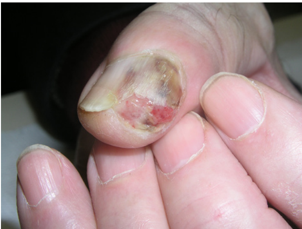
Figure 3. SCC with eroded mass under the nail, characterized by onycholytic area with oozing from the nail in late stage due to subungual erosion.