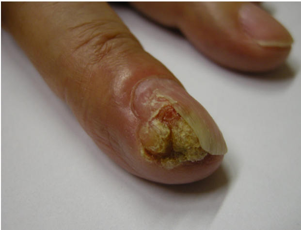
Figure 1. SCC with lateral detachment of the nail and a warty aspect of the exposed nail bed and lateral nail fold with black discoloration that tends to ulcerate with a scab formation.