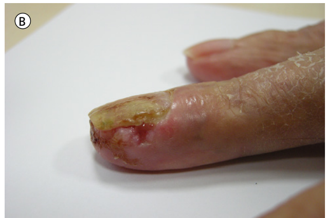
Figure 6. Clinical picture in (A) frontal view and (B) lateral view of SCC and onychoscopy of typical alterations of SCC: onycholysis, irregular vascularity, and erosion of nail bed (C) before and (D) after nail clipping onycholytic nail plate.