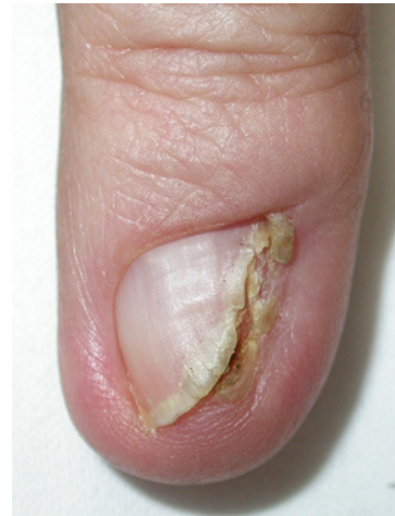
Figure 2. SCC with lateral verrucous lesion, frequently misdiagnosed as viral wart especially when the lesion is characterized by nail plate partial or total absence due to a hyperkeratotic nodule.