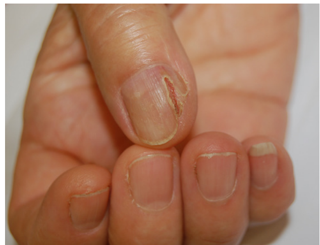
Figure 5. SCC with a longitudinal erythronychia and erosion of under nail bed.

The most important diagnosis to rule out in case of suspect SCC is viral warts. HPV-induced warts appear as