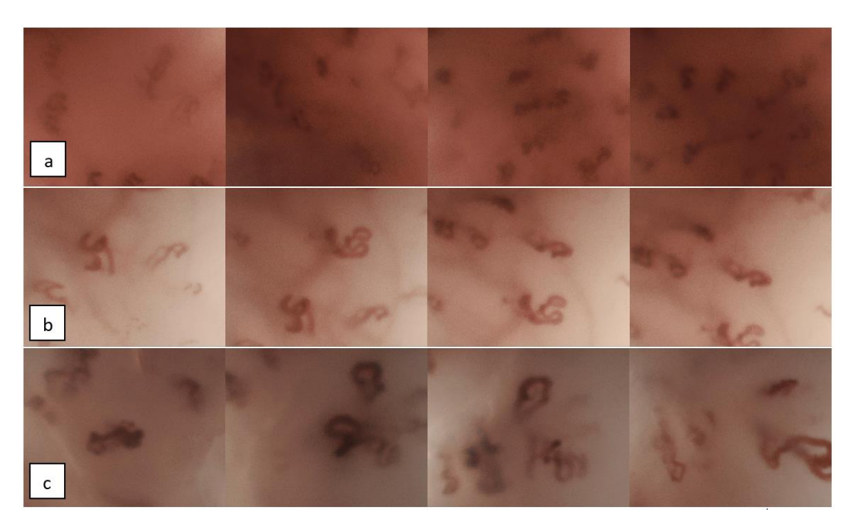
Figure 1. Examples of perpendicular vascular changes (PVC)-positive lesions: series of contact endoscopy with narrow-band imaging (NBI-CE) images depicting PVC. Histological diagnoses: (a) squamous cell carcinoma (SCC), (b) carcinoma in situ, and (c) papillomatosis.

In all other cases, the lesions were declared PVC-negative (Figure 2a-c).