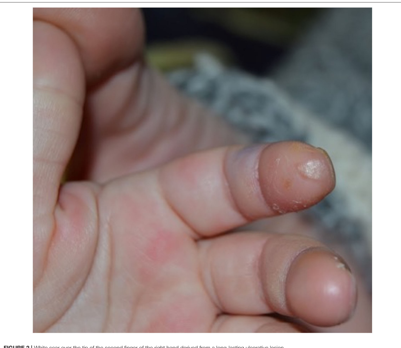
FIGURE 2 | White scar over the tip of the second finger of the right hand derived from a long-lasting ulcerative lesion.

and bilateral periventricular hyperechoic zones at the occipital lobe were detected.