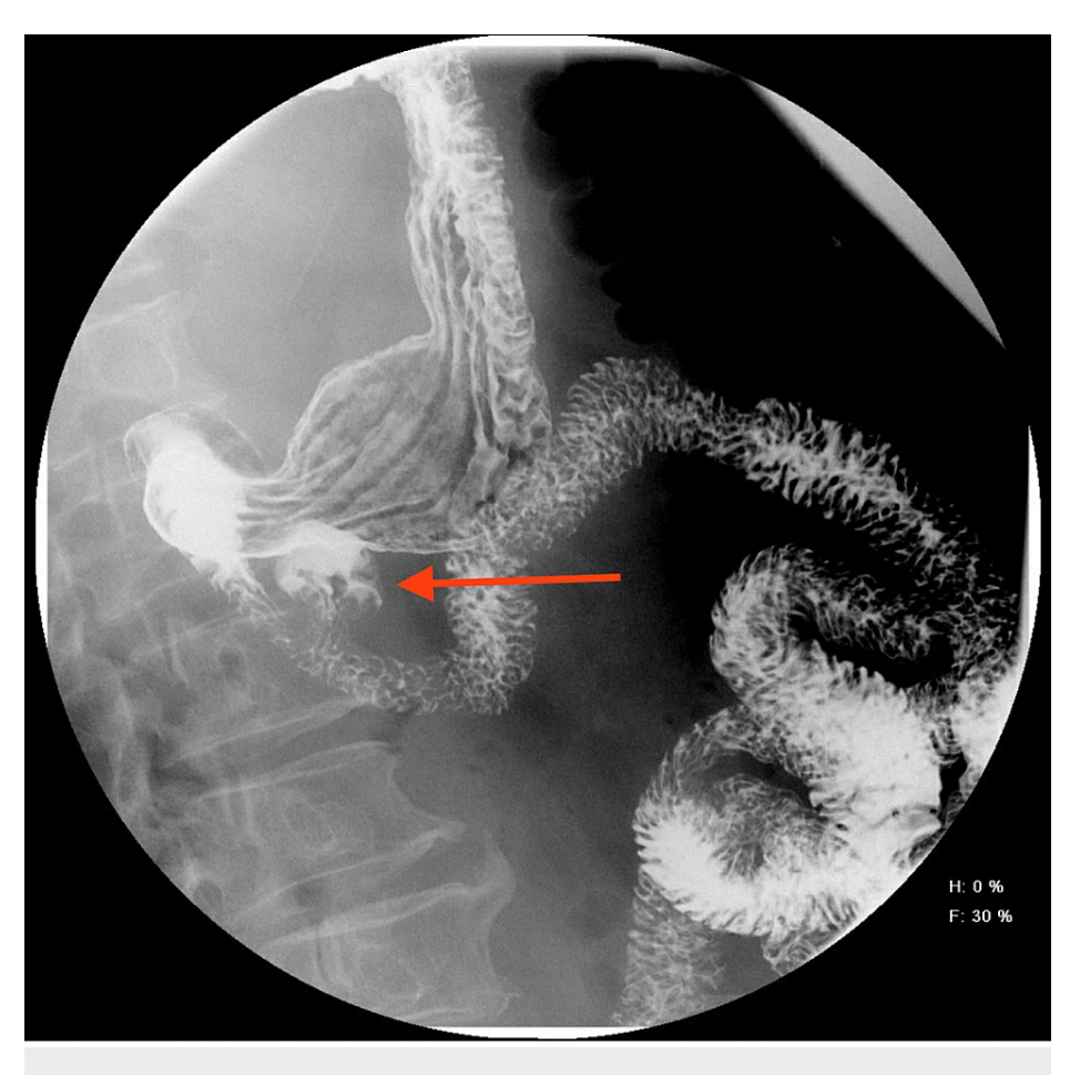
FIGURE 2: Barium meal showing PAD (arrow) in the second part of the duodenum.

PAD, periampullary duodenal diverticulum.