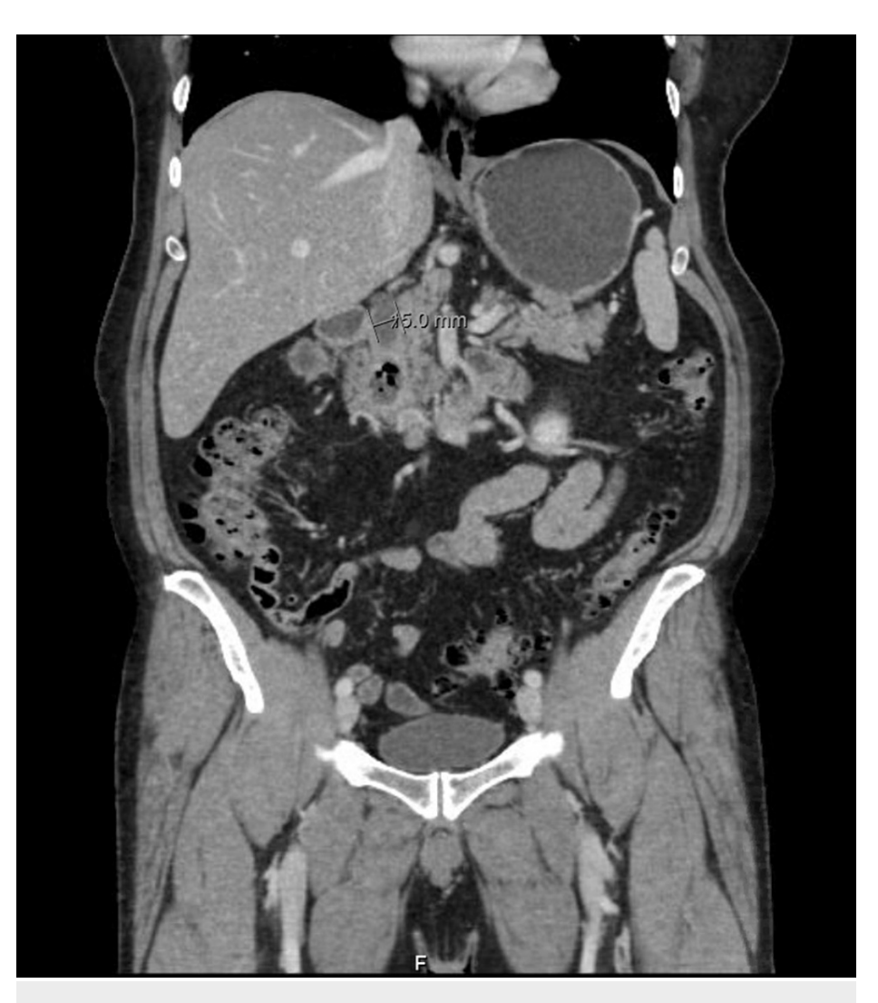
FIGURE 1: CT abdomen and pelvis (coronal view) showing a duodenal diverticulum measuring 5 mm and arising from the second part of the duodenum.

Furthermore, a contrast barium meal was ordered, which showed a duodenal diverticulum in the second part (Figure 2).