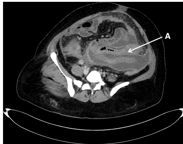
Figure 3 CT scan (transverse section) showing A: bowel oedema

control programme (RNTCP) guidelines based on body weight for 6 months.