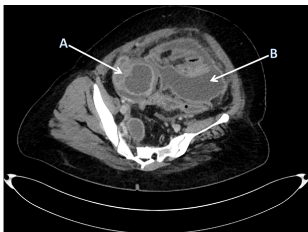
Figure 2 CT scan (transverse section) showing, A: right tubo-ovarian mass and B: pelvic collection.

As there was a high clinical suspicion of TB, pulmonary medicine and TB expert opinion was sought. Presumptive EPTB was clinically and radiologically diagnosed and she was started on Anti Tuberculosis treatment (ATT) as per revised national TB