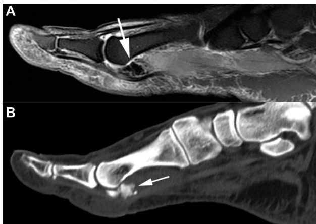
Figure 2 (A) A fat-saturated fast SE T2 weighted sagittal image shows an amorphous signal void area compatible with calcification underneath the flexor tendon of the great toe (arrow). (B) A sagittal reformatted computed tomography image corresponding to Figure 2A confirms that the lesion is a calcified mass (arrow).