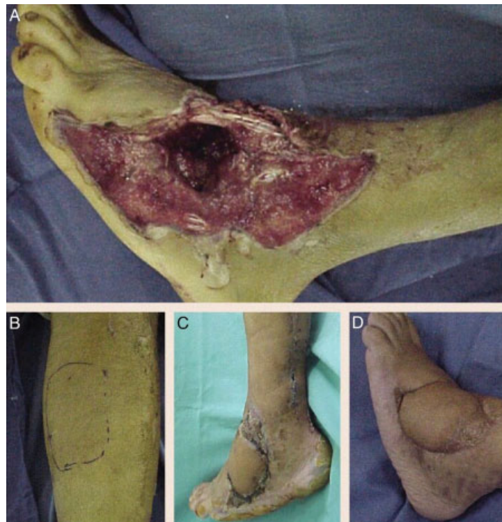
Fig. 2 Trauma by crushing. A, extensive lesion on the back of the foot with a critical area of 8 × 8 cm; B, donor area; C, receiving area after sural fasciocutaneous flap coverage; D, late postoperative period.