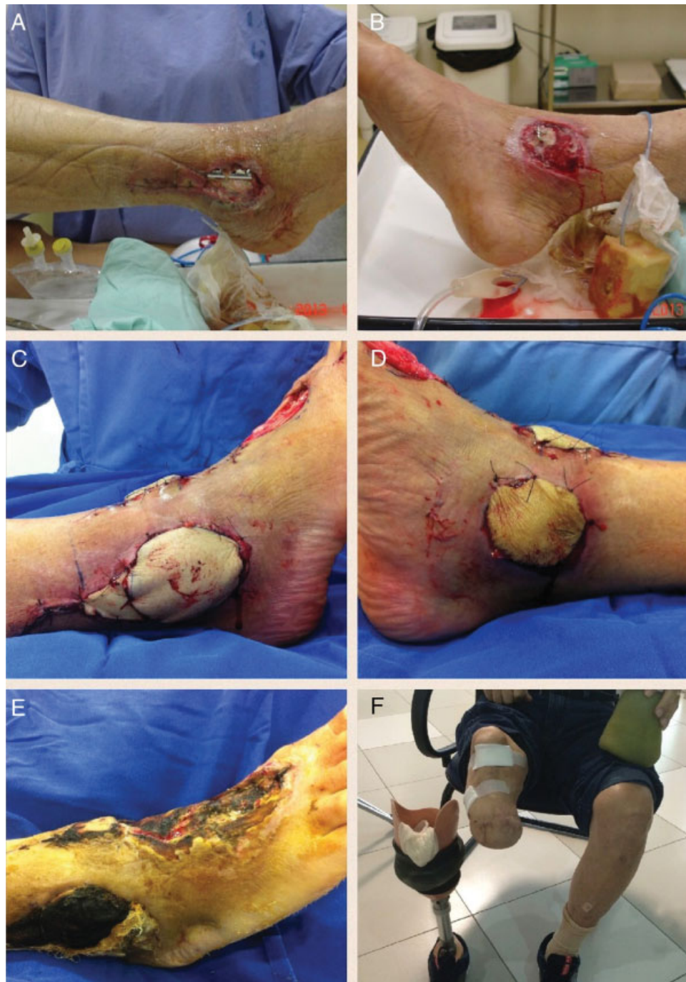
Fig. 3 Lateral (A) and medial (B) aspect of an open malleolus fracture. Infection in the bilateral operative wound led to the failure of the covering tissues. Reverse-flow sural fasciocutaneous flap for the lateral malleolus (C) and a pedal flap for the medial malleolus (D) were performed. Total necrosis of both flaps (E). Evolution for amputation (F).

the Achilles tendon, the lateral and anterior aspect of the ankle, the back of the foot, the lateral aspect of the hindfoot, and the lower third of the leg. Other indications, such as full heel coverage and medial aspect of the distal third of the leg, are considered relative because of the small distance to the rotational point, which may affect the vascular pedicle at attempts to reach these regions, compromising the flap. 1-3,6