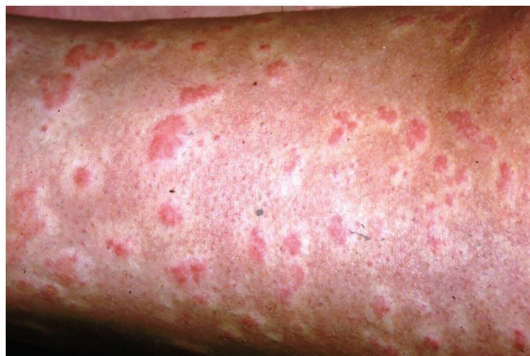
Fig. 1 Urticaria

The authors are aware of a number of anecdotal reports of adrenaline injections routinely administered through clothing in emergency departments without any difficulties