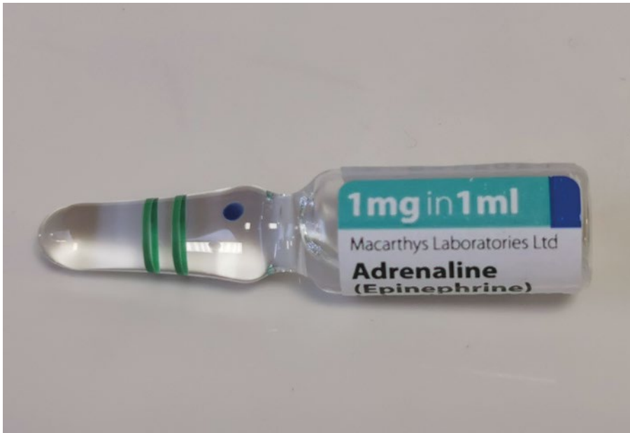
Fig. 3 Adrenaline 1:1,000 ampoule