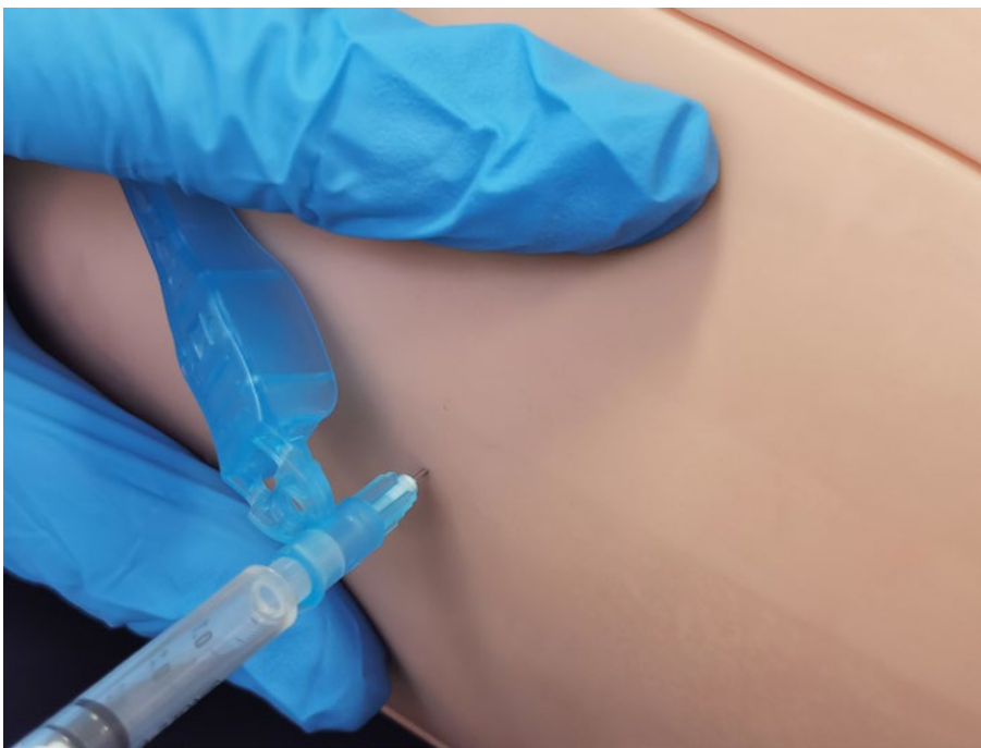
Fig. 4 IM injection – insert needle at 90 degrees

currently available in the UK are Emerade, EpiPen and Jext, which are designed for self-use. 66 The obvious perceived advantages of AAIs are that they are quick and relatively easy to use. If an AAI is used, it is important to follow the manufacturer's guidelines for its use, taking particular care to avoid accidental self-injection which has been reported. 66