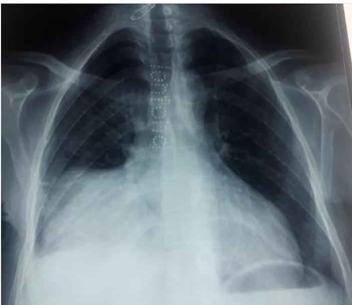
Figure 1: homogenous lesion in the right hemithorax extending from the hilum to the level of diaphragmatic dome; the medial border merged with the mediastinum with loss of the cardiac silhouette