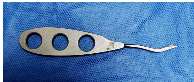
Figure 1 Photograph of a modified acupotomy.

The modified acupotomy treatment was performed in the outpatient operating room by an experienced hand surgeon. At the beginning, the location of A1 pulley was marked on the skin of the affected thumb according to a previous study. 16 After skin sterilization, local anesthesia was established by administration of 2 mL of 2% lidocaine. Next, a longitudinal incision of 3 mm was made with a No. 11 scalpel at approximately 1 cm proximal to the A1 pulley when the thumb was held in extension (Figure 2A). The modified acupotomy was then inserted into the same track to reach the proximal edge of the A1 pulley (Figure 2B). The blunt tip and extended edge helped the surgeon to confirm the proximal edge of the A1 pulley, and slipped the device into the space between the A1 pulley and the underlying flexor tendon minimizing the damage of the flexor tendon. The whole A1 pulley was incised along the direction of the flexor tendon with the sharp