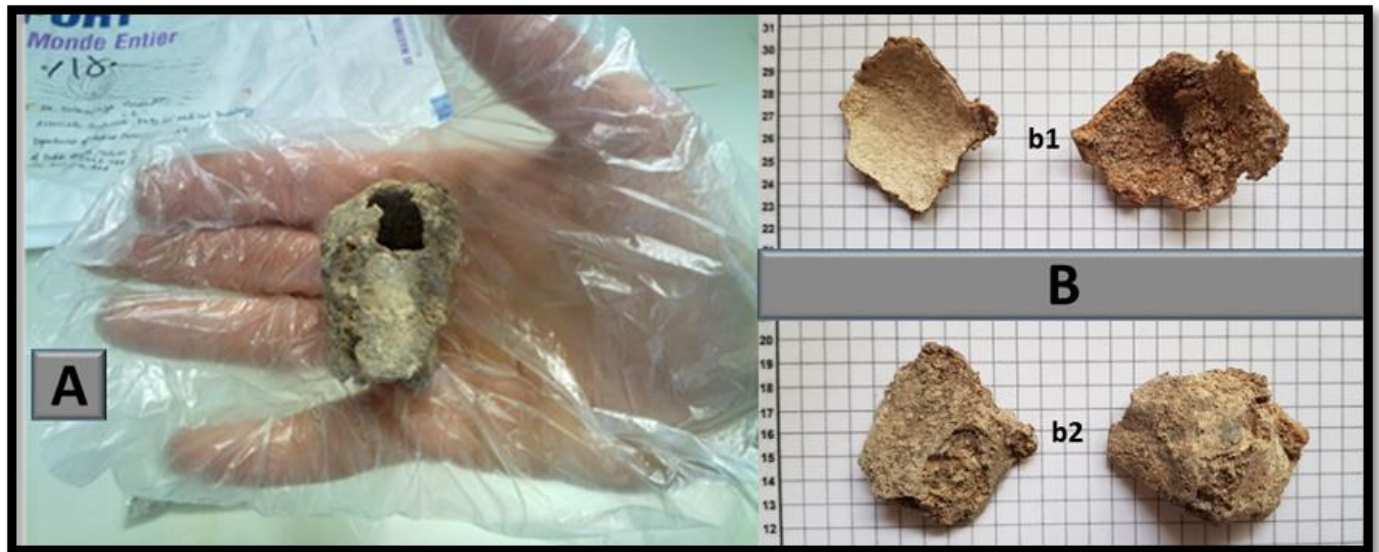
Fig. 1: The calcified object identified as hydatid cyst ( A, one of the recovered cysts, B, Represents the inner concave surface and the outer convex surface of that cyst)