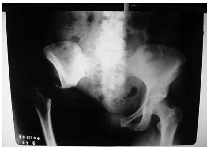
Figure 4 – X-ray of a patient previously submitted to right internal hemipelvectomy. Enneking II + III resection.