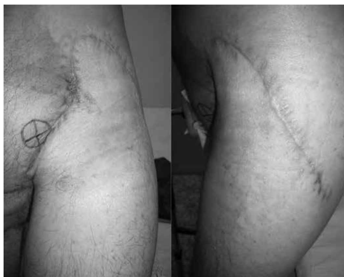
Figure 2 – Operative wound of a patient who underwent left internal hemipelvectomy 100 days ago. Incision was made in inverted V.

Obtaining surgical margins similar to that of a classic amputation, the lack of tumor involvement in the femoral vascular-nervous bundle and the sciatic nerve, preserving partial function of the lower limb, and the patient having favorable life expectancy