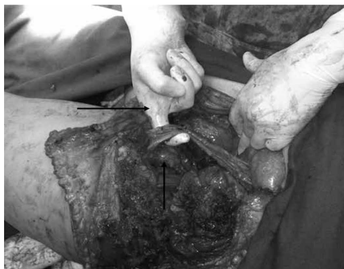
Figure 3 – Photo of the internal hemipelvectomy surgery showing the preservation of the femoral vascular-nervous bundle anteriorly and of the sciatic nerve posteriorly.