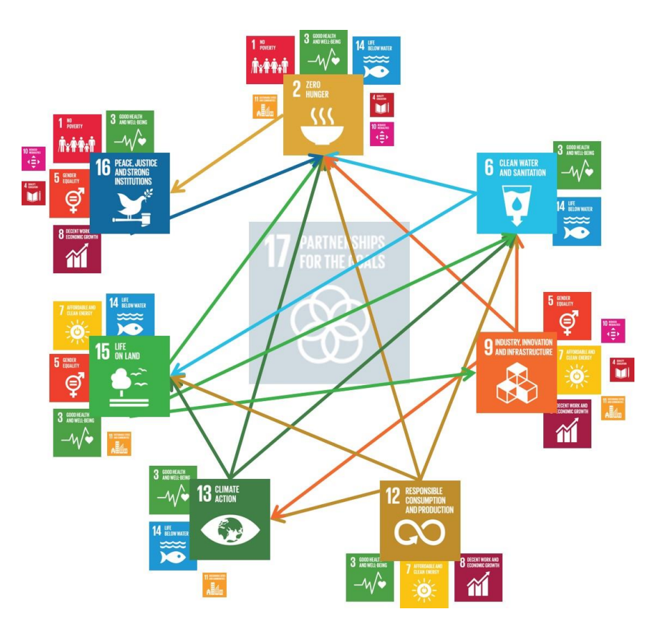
Figure 2. Links between sustainable development goals in the "edible insects' idea".