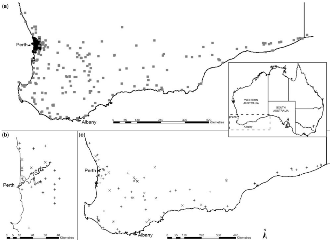
Figure 1. Collection locations of dugite P. affinis specimens used for this study: a) urban specimens (around the Perth metropolitan area where human population density exceeded 500 persons·km 2 at the time of the nearest Australian Bureau of Statistics census) are indicated by black dots, non-urban specimens are shown with grey squares; distribution of dugites containing prey in gut contents for b) urban and c) non-urban specimens. Legend: cross—non-native rodents; diamond—native rodents; plus—reptiles. Study location with reference to the wider Australian continent is shown in center right.

where there have been local prey extinctions recorded as a result of predation pressure (Savidge 1988). By contrast, P. sebae in suburban areas in Nigeria supplement their diet with synanthropic rats and domesticated poultry, but are significantly smaller than conspecifics from non-urban environments: the authors did not suggest any reason for this difference (Luiselli et al. 2001). In the present study, we investigate the effect of urbanization on the feeding ecology of the dugite Pseudonaja affinis , Elapidae (Günther 1872). This species is one of the most common snakes of south-west Western Australia, thriving in woodlands, heaths, and urban environments (Chapman and Dell 1985), possibly via supplementation from the spread of the invasive house mouse Mus musculus (Shine 1989). Although the house mouse is a small species, it is larger than the majority of urban lizards in Western Australia (How and Dell 2000), and its communal nesting and prolific breeding (e.g., Gomez et al. 2008; Vadell et al. 2010) appears to provide dugites with frequent opportunities to eat multiple individuals (and therefore larger meals). Dugites are regarded as one of the best urban-adapted large-bodied reptiles in Australia (How and Dell 1993), which makes them ideal model animals for urban/non-urban comparisons. Assuming dugites benefit from the presence of synanthropic rodents, then we make the