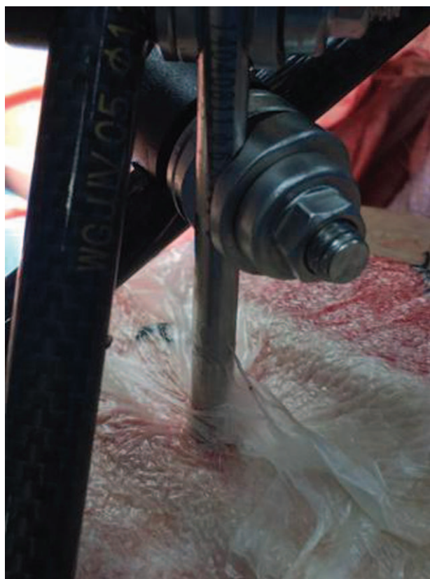
Figure 2. An adhesive plastic drape is wrapped around the pins to cover the foam without creating tension.