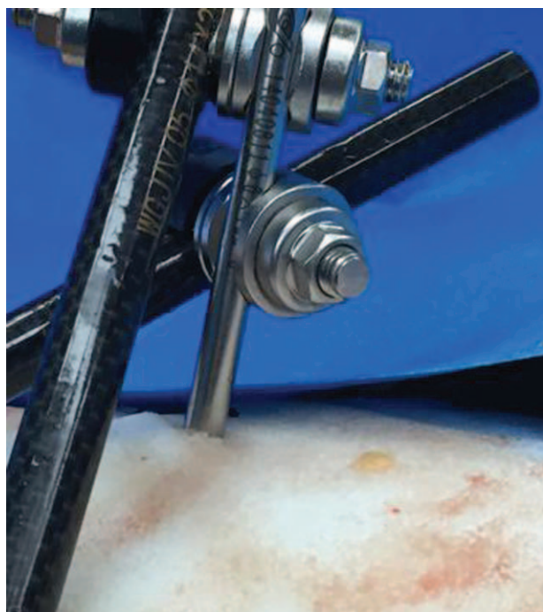
Figure 1. After carefully cleaning the wound edges and bed, foam from the VSD device is cut to the dimensions of the wound and applied directly onto the wound and around the pins used for fixation. VSD = vacuum sealing drainage.