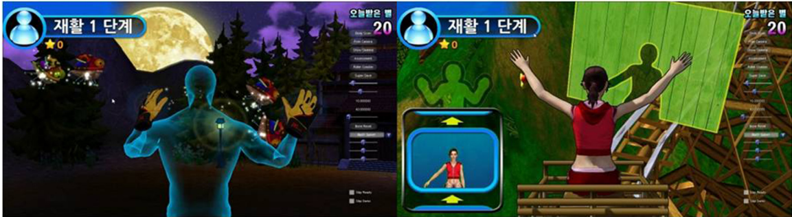
Bug Hunter Game Rollercoaster Game