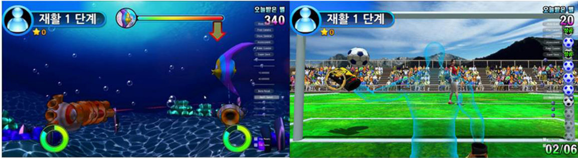
Underwater Fire Game Goalkeeper Game