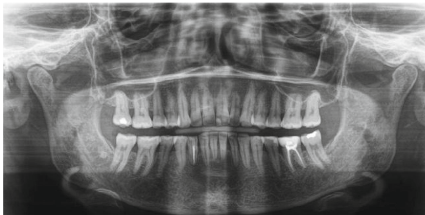
FIGURE 6: Final orthopantomography.

the advantage of being easier for the patient to maintain oral hygiene. On the other hand, patient compliance is essential with removable retainers because without it, a relapse may occur. This method of retention places full responsibility on the patient in maintaining tooth alignment following orthodontic treatment [14].