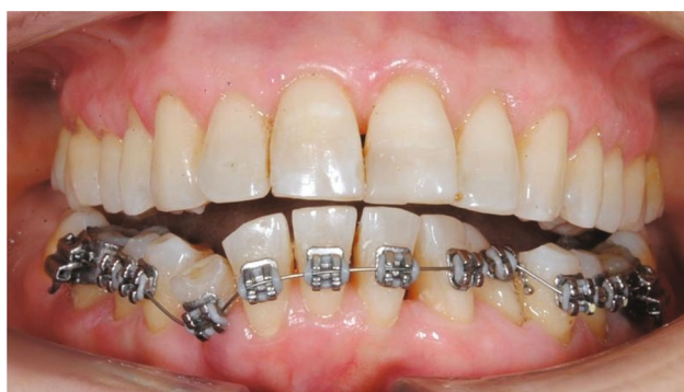
FIGURE 3: 0.012-in NiTi archwire.

2.5. Treatment Results. The multibracket treatment lasted a year and a half. The mandibular right canine was repositioned (Figure 6) and a periodontal examination showed probing pocket depth values of 3 mm. In addition, the general dentist decided to perform root canal treatment of the canine one year after the beginning of orthodontic treatment as the tooth was not vital and not symptomatic. Elements 3.2 and 3.3 were repositioned too, and spaces were closed (Figure 7).