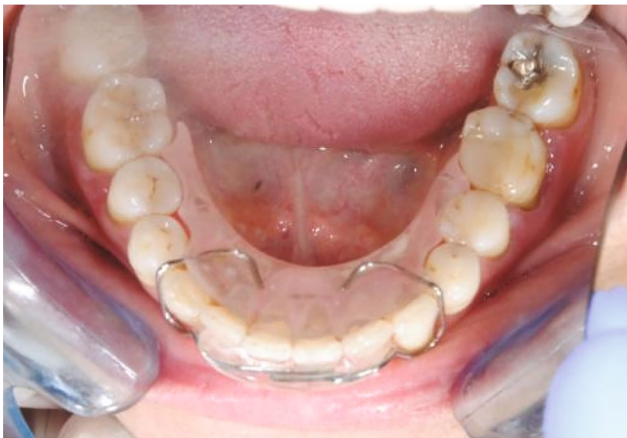
FIGURE 8: Spring retainer.

gingival inflammation [15]. Al-Moghrabi et al. compared fixed and removable retainers in a 4-year study, concluding that both are associated with gingival inflammation, but the former were more effective in maintaining mandibular alignment [16]. However, a recent systematic review assessed that they are compatible with periodontal health [17]. Proper oral hygiene and the correct use of dental floss underneath the retainer are crucial to avoid periodontal complications [18].