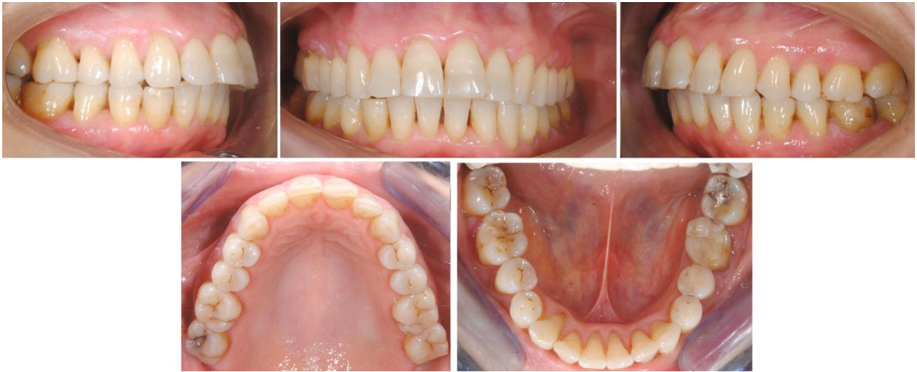
FIGURE 7: Final intraoral photographs.