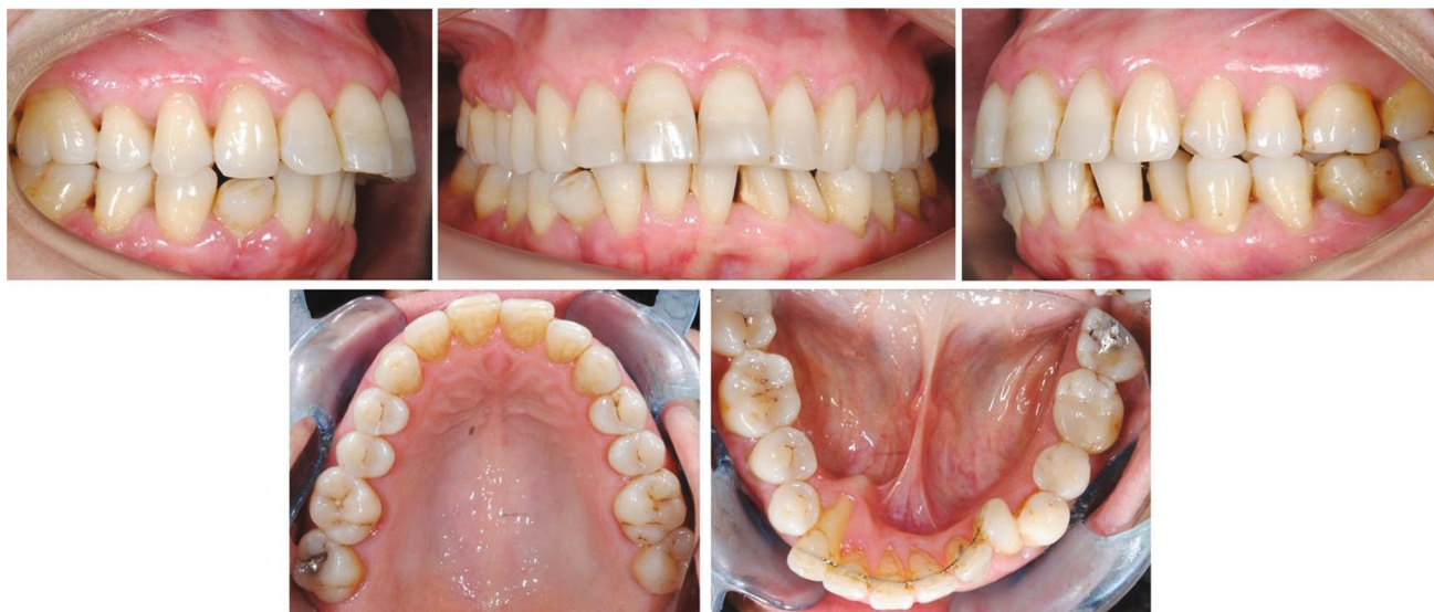
FIGURE 1: Initial intraoral photographs.

These movements cannot be considered an orthodontic relapse, as they do not show similarity to the initial malocclusion. Such alterations are attributed to a distortion or activation of the wire, caused by a not yet known mechanism [10]. Katsaros et al. [1] were the first to describe unwanted tooth movements in the presence of a fixed mandibular retainer. Later, many similar cases have been reported. For instance, Pazera et al. [9] reported the case of a mandibular canine with increased root torque. Furthermore, Singh showed the case of a canine completely avulsed [11].