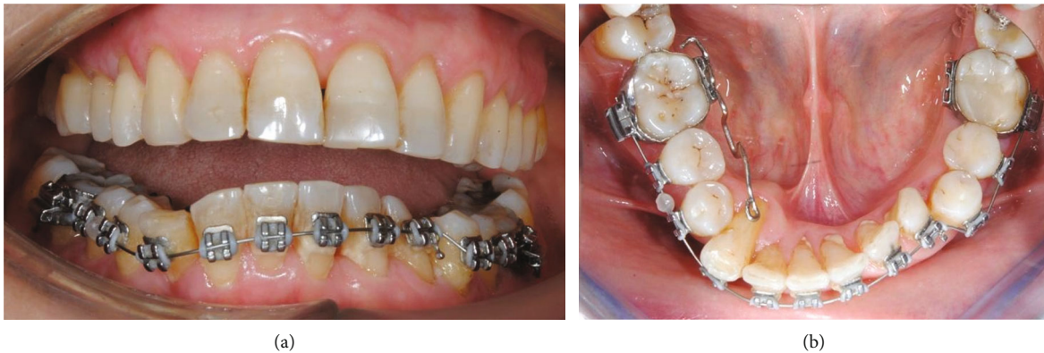
FIGURE 5: 0.014-in NiTi 3M (a); orthodontic sectional (b).