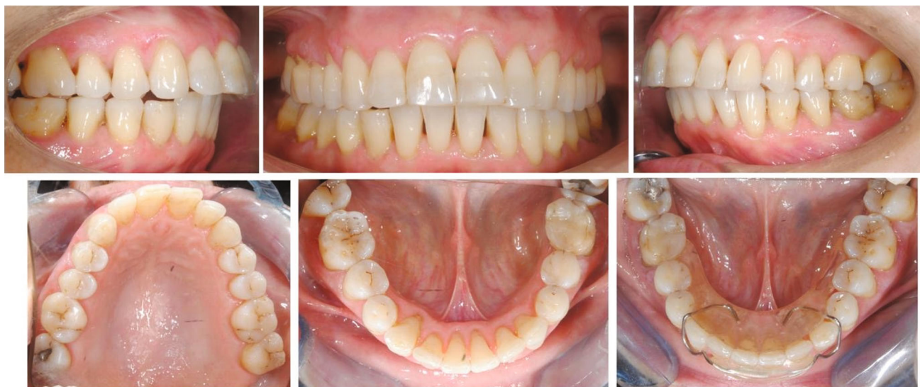
FIGURE 9: Follow-up after 18 months from the end of the orthodontic treatment.

adhesive protocol and composites based on their experience and the results of the literature. Concerning the former, the enamel bond strength of universal adhesives is improved using the total etching technique [24]. In addition, a recent study demonstrated that a universal adhesive, generally employed in restorative dentistry, could be a valid alternative to the conventional orthodontic adhesive for correct adhesion of orthodontic retainers [25]. Furthermore, many studies assessed that orthodontic resin composites would be preferable than flowable composites while bonding the fixed retainer because of higher bond strength and survival rates [26–28].