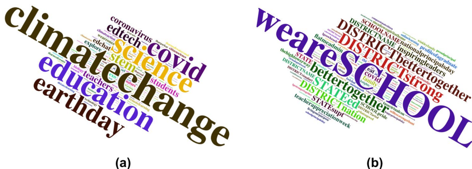
FIGURE 3 Wordclouds of most commonly used hashtags. (a) Nation-wide sample (b) urban public school district.

The common denominator for both data samples is that YouTube is the most frequently shared domain. In the case of the nation-wide data, a random sample of 50 URLs revealed that the shared videos seemed to focus on learning resources, such as learning the alphabet, experiments (e.g., liquid nitrogen balloon), and recorded expert panels on, for example, online safety for kids. Similarly, a closer look at the shared videos in the urban sample, which was also based on a random sample of 50 URLs, showed videos on safety (e.g., in times of COVID-19) and virtual concerts. The other domains included information portals specifically targeted at educational professionals and leaders (e.g., edsurge.com, naeyc.org) and online tools, such as applications for creating newsletters or effectively using social media (e.g., smore.com, careerarc.com). Additionally, general news sites (e.g., nytimes.com) and other social media platforms (e.g., facebook.com) were often included in the Tweets. The content