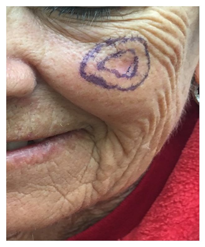
Figure 2 Pre-operative photograph of an MIS of the face outlining the clinical margins examined with a Wood's lamp (inner marking) and Mohs excisional specimen (outer marking).

The first step in MMS for melanoma is to identify and mark the lesion's clinical borders (Figure 2).<sup>3,8</sup> Many advocate for the use of a Wood's lamp to assist in the identification of the tumor's extent, particularly for lentigo maligna (LM) and lentigo maligna melanoma (LMM) as these lesions are notorious for their irregular and often indistinct clinical borders.<sup>3,8,29,41,42</sup> After identifying and marking the precise clinical border of the lesion, the surgeon often then marks the initial margin which may be anywhere from 2 to 10 mm around the clinical border depending on the size of the lesion, anatomic location, and tumor stage. If tissue conservation is imperative due to anatomical or functional considerations (e.g., tip of nose and abutting tear duct), the surgeon may use the clinical borders of the lesion as the peripheral margin for the debulking specimen.<sup>43</sup> However, it is generally recommended that an