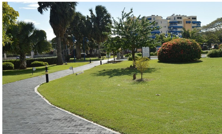
Fig. 1 Circumferential track at Emancipation Park, Jamaica

Emancipation Park is a public park officially opened in 2002 and managed by the government through the National Housing Trust, a statutory body [19]. The well-maintained park occupies approximately 7 acres (28, 328 m 2 ), in the urban business district of New Kingston in the parish of St. Andrew, Jamaica. Previously a large dustbowl, the park was transformed into an oasis using public funding to include a circular 500 m track paved with unitary surface (see Fig. 1), many attractively