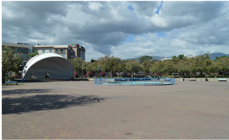
Fig. 3 Promenade surrounding bandstand at Emancipation Park, Jamaica

scans were repeated sequentially, starting with the lowest numbered target area until the 1-h observation period had elapsed. Repeat observations were collected daily for 13 randomly selected predetermined 1-h observation periods (20% of all observations) by a pair of trained assessors who simultaneously and independently conducted observations.