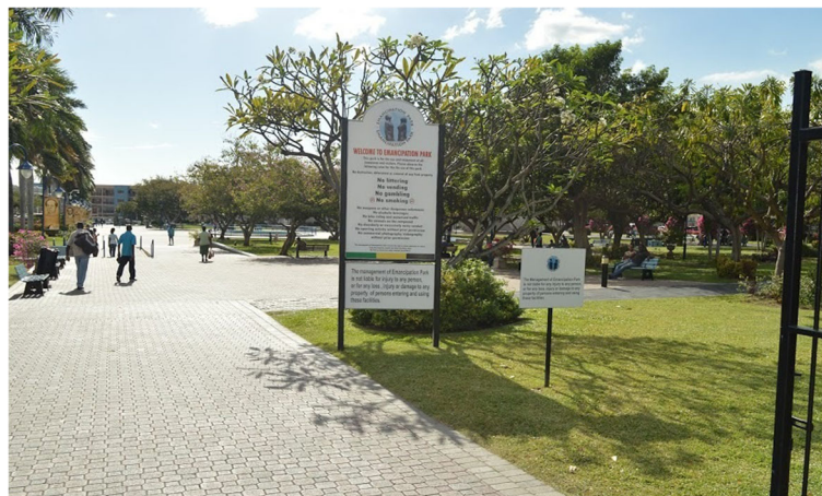
Fig. 2 Main walkway from eastern entrance of Emancipation Park, Jamaica

Scans of each TA were conducted four days per week, four times per day (6–7 am; 12:30–1:30 pm; 2:30–3:30 pm; 5:30–6:30 pm) over the four-week period from June 16–July 12, 2015. The path was assessed separately. Observers were stationed at one point and counted users for 42 s during each observation time (the approximate time of walking one lap) [20]. This frequency was based on the recommendations for obtaining a robust estimate of park user characteristics and PA using SOPARC by Cohen et al [26]. If all TAs were scanned in less than an hour then