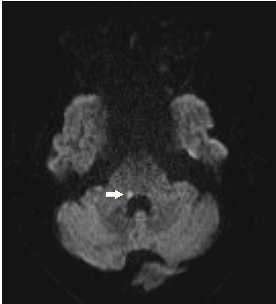
FIGURE 1: MRI Brain DWI sequence with arrow showing an acute infarct in the right facial colliculus

An immediate CT brain done did not show any large territorial infarct or intracranial hemorrhage. He was admitted to the hospital and MRI brain subsequently showed an acute infarct affecting the right facial colliculus in the dorsal pons shown in Figure 1 below.