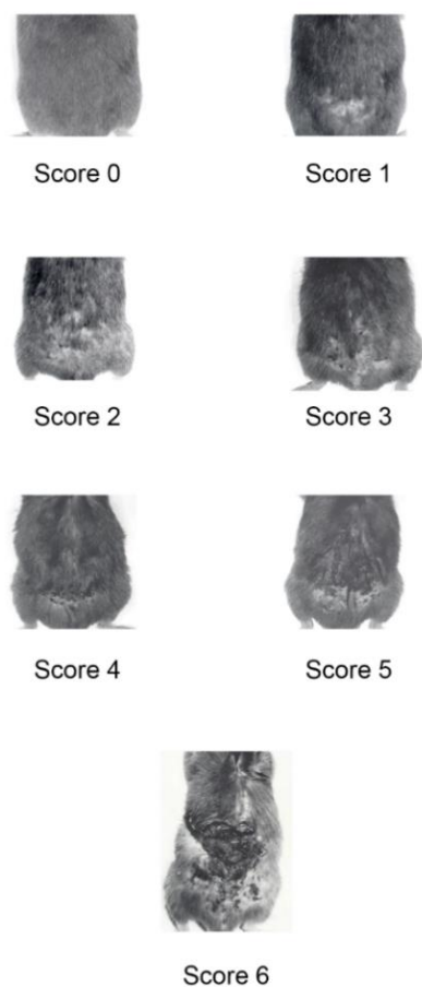
Figure 1. KS-like lesions developing at the dorsal area of BKV/Tat transgenic male mice, scored according to lesion severity, as described in Methods.

To this aim, BKV/Tat mice bearing initial KS-like lesions or no lesion were injected locally with a mixture of IL-1, TNF- \alpha , and IFN- \gamma three times (day 0, 4, 8) and were monitored up to 10 weeks as compared with untreated mice. Lesion dynamic was evaluated by grading lesion severity according to the scoring system depicted in Figure 1.