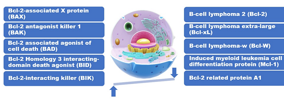
FIGURE 2: The balance between significant pro-apoptotic and antiapoptotic proteins involved in the regulation of apoptosis