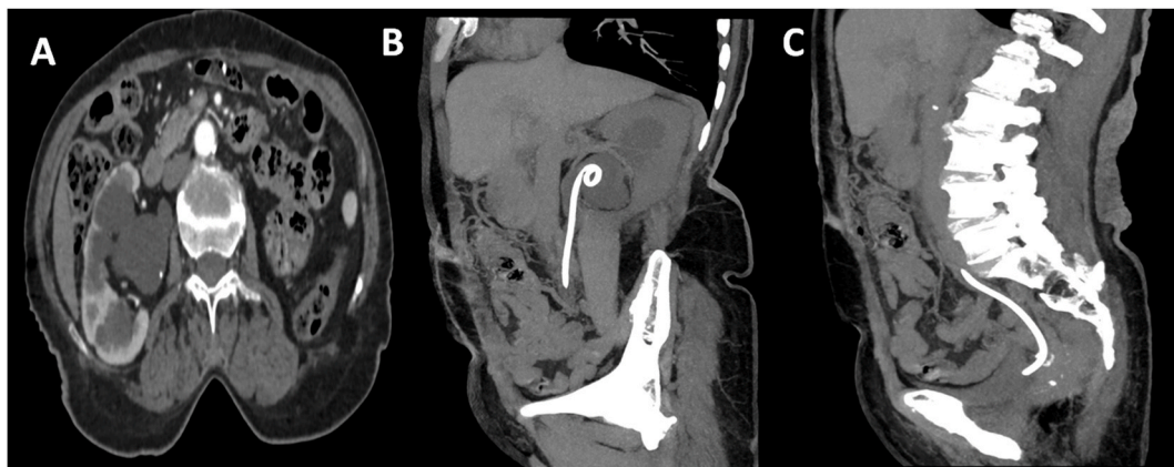
Fig. 2. (A) abdominal CT scan showing right hydronephrosis secondary to pelvic invasion by a colorectal cancer. (C, D): Antegrade insertion of a JJ ureteral stent.