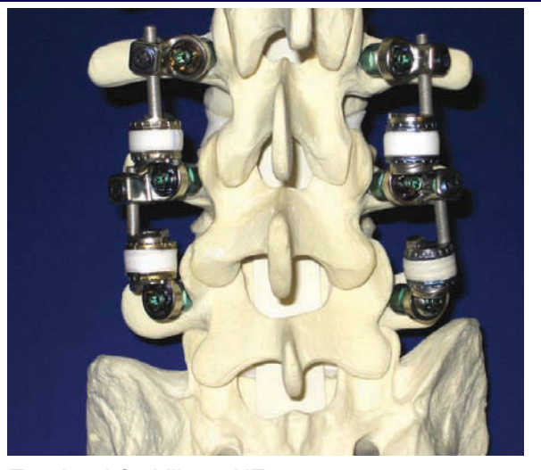
Two-level Stabilimax NZ.

a standard deviation of 1.6 mm. It is important to note that more motion was maintained after instrumentation with the Stabilimax NZ than has been found with fusion constructs.<sup>35,36</sup> (A more detailed analysis of this data has been accepted for presentation at the 2007 Annual Meeting of the International Society for the Study of the Lumbar Spine.)