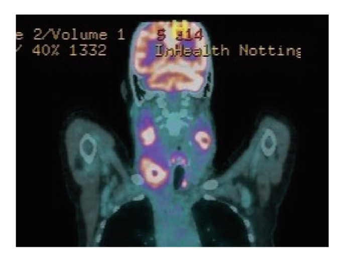
Figure 1. The <sup>18</sup>FDG-PET/CT scan showing highly FDG-avid extensive confluent lymphadenopathy bilaterally in the neck. Central photopenia is suggestive of necrosis.