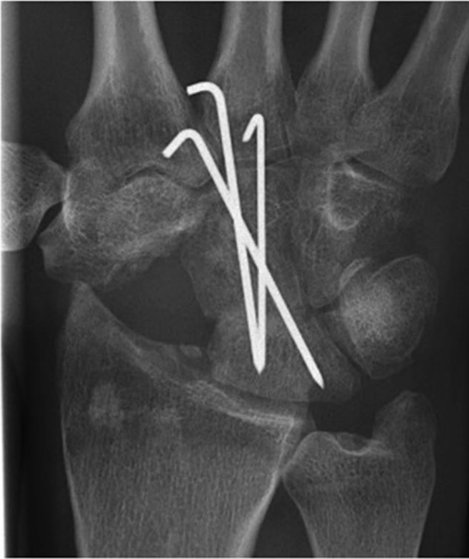
Figure 1. Radiograph of a lunocapitate arthrodesis.

nonunion advanced collapse operated on at least 1 year earlier at our clinic ( n = 10 ). Two patients had nonunion of the fusion ( n = 2 ) and were excluded. One patient declined participation owing to a lack of time. Thus, 7 patients were examined. Lunocapitate arthrodesis had been performed by a dorsal approach through the third and fourth extensor tendon compartments; the posterior interosseous nerve was sectioned and the wrist capsule was opened as described by Berger. 7 The scaphoid was resected and the distal articular surface of the lunate and the proximal pole of the capitate were prepared by removing the cartilage and subchondral bone. Bone was grafted from the scaphoid, radius, or iliac crest, and the fusion was stabilized with 2 to 3 Kirschner wires (Fig. 1), taking care to reduce the lunate from extension. The capitolunate, lunotriquetral, and arcuate ligaments were not violated. After surgery, patients wore a short plaster cast or a hard wrist orthosis for 6 to 14 weeks. Full loading was permitted after the fusion was clinically and radiologically healed and the Kirschner wires had been removed.