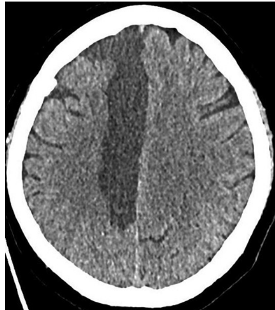
Fig. 2. A native CT scan of the brain on day six showed a hypodensity indicating the infarction in the territory of the right ACA.

undergoing early rehabilitation after stroke demonstrated that its co-administration significantly improved mood, activities of daily living, and stroke severity compared with the medication of either drug alone or placebo [5, 6].