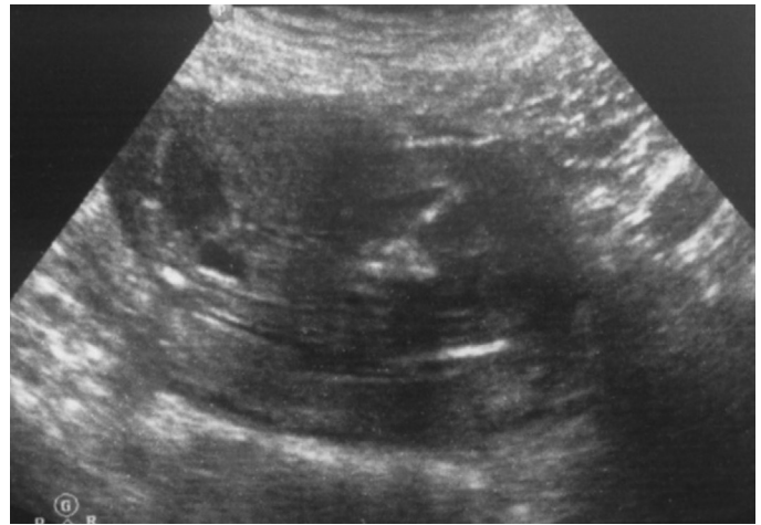
Figure 2. Sagittal view of the fused lower limbs