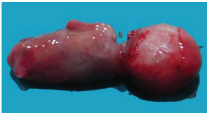
Figure 3. Photography of the fetus showed imperforate anus