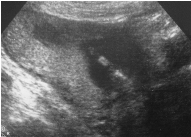
Figure 1. The lower limbs observed as fused

The patient was hospitalized at 13 weeks and 4 days for termination of the pregnancy. Misoprostol was used for medical abortion. On physical examination, the fetus had fused lower limbs with no feet like a tail, absent external genitalia, imperforate anus, and a single umbilical artery (Figure 3, 4). The upper extremities were morphologically normal. Autopsy was performed. At autopsy, the external examination revealed imperforate anus, absent external genitalia, single umbilical cord, and fusion of lower extremities. Bilateral renal agenesis was also noted at autopsy.