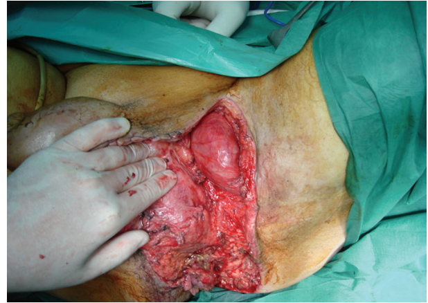
FIGURE 4: The left testicle is transpositioned into a subcutaneous pocket in the inner side of the left thigh.

Once a diagnosis of FG has been established, the central principles of management are aggressive hemodynamic stabilization and parenteral broad-spectrum antibiotics which will be either changed or continued according to the culture findings. In order to ensure a successful outcome, the critical step is urgent and extensive surgical debridement [1, 2, 7].