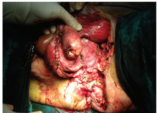
FIGURE 3: Wide-open drainage of the necrotic skin in the scrotum and perineal area.