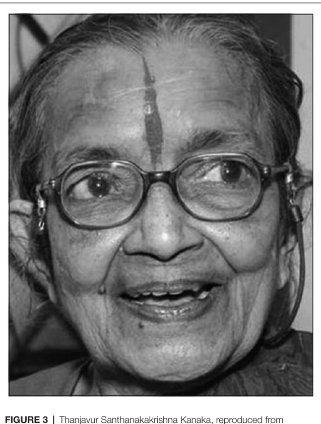
FIGURE 3 | Thanjavur Santhanakakrishna Kanaka, reproduced from Vilanilam et al. (2016).

(Blomstedt and Hariz, 2010; Hariz et al., 2014). Starting in the 1960s, she implanted gold electrodes for chronic external stimulation of different subcortical targets, including the ventrolateral thalamus and the striatopallidal complex, in some cases targeting multiple structures in the same patient (Bechtereva et al., 1975). She called her method therapeutic electrical stimulation (TES), and she used a current with "highrate pulses" (Bechtereva et al., 1975), meaning a stimulation with high frequency. The electrodes remained implanted for up to 1.5 years with stimulation sessions conducted once or twice a week through an external stimulator. Her reports showed a significant improvement of the symptoms with few relevant side effects (Bechtereva et al., 1975).